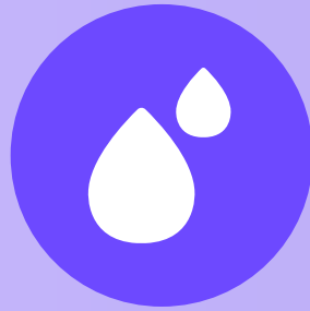
CAT 5 water installation