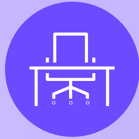
Fitted office accommodation