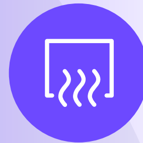
6 air changes per hour