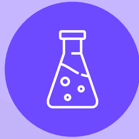
Fitted lab accommodation