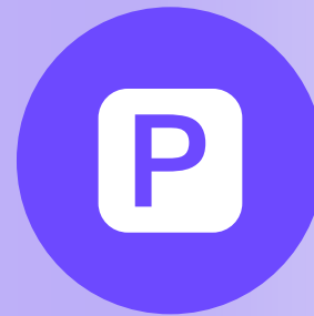
46 car parking spaces