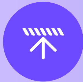
Raised access floors