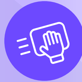
Wipeable ceiling tiles